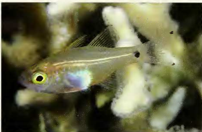
Figure 5. Underwater photograph of Zorania viridiventer taken at site where holotype was captured.